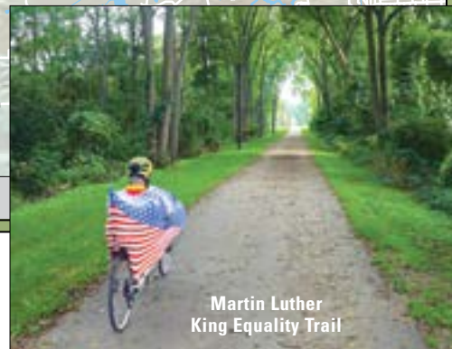
Martin Luther King Equality Trail

the headwaters of four major Michigan rivers. Native Americans called this area "The Land of Falling Waters." At the western trailhead in Concord, the trail crosses a bridge over the upper reaches of the Kalamazoo River where you can view a great expanse of marshy wetlands. One of the highlights of the trail is a causeway that runs through the middle of Lime Lake. This is a great place to stop, relax, view wildlife and enjoy the natural beauty of this turquoise blue lake. On the west side of Lime Lake, a new 1-mile paved connector trail takes you to Spring Arbor. Along the way, the trail passes through a lush landscape of wetlands, shady woodlands and fields of corn and soybeans.